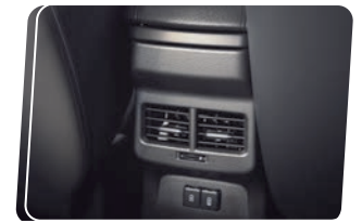
Rear AC Vents with Fast Charging USB Ports