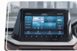
SmartPlay Pro+ with Surround Sense powered by ARKAMYS