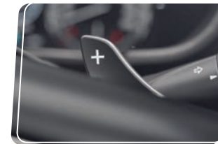
6-Speed AT with Paddle Shifters