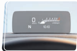
Head Up Display