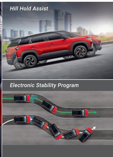
Hill Hold Assist