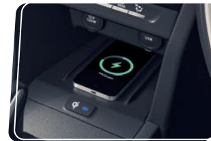
Wireless Charging Dock

The Hot and Techy Brezza carries a youthful and exciting appeal on the inside with your convenience at its core. It gets a unique design, modern and sleek look and black and brown interiors with silver accents for a sporty and urban feel. The City-Bred SUV also has Rear AC Vents, a Fast Charging USB Port (Type A and C) and a flat bottom Steering Wheel for your enhanced comfort and convenience. The 6-Speed Automatic Transmission with Paddle Shifters and Telescopic Steering ensure you go on city adventures comfortably.