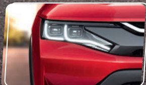
Dual LED Projector Headlamps with LED DRLs