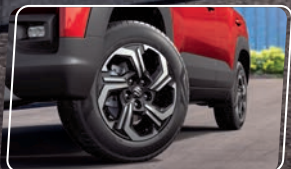
Bold Geometric Alloy Wheels