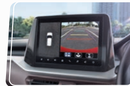
360 View Camera