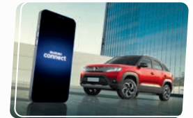
Next Gen Suzuki Connect